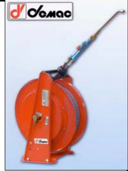
STAFFA GIREVOLE 120° (OPZIONALE) SWIVEL BRACKET 120° (OPTIONAL)